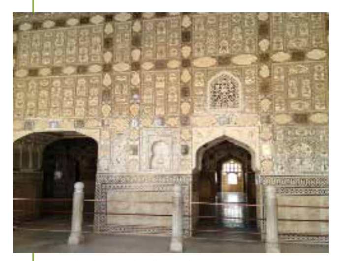
Sheesh Majal, The Amber Fort, Jaipur

were built to last. Amber Fort will never fall! My daughter buys a hanging of little elephants from a demanding girl with too-wise eyes. She then helps us across the busy road to our car, holding a sure palm to halt traffic. She is savvy and smart and I wish only for her an education and good life. But what are her prospects, a street urchin selling trinkets? I regret not buying more from her, giving her the banana she asked for. I had planned it for lunch,